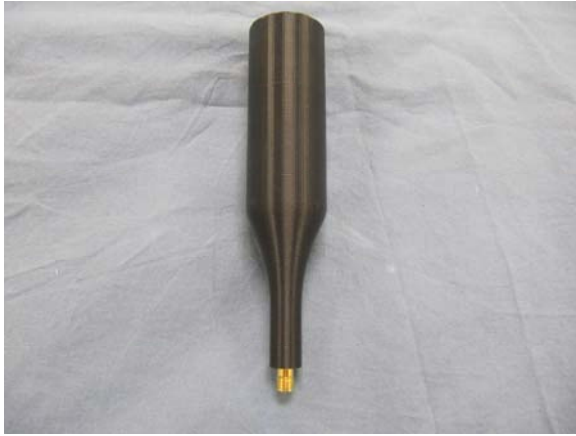
FRF-180 Ku-band Antenna