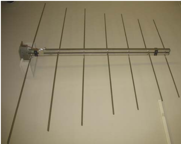
FRF-130 Individual LP Antenna